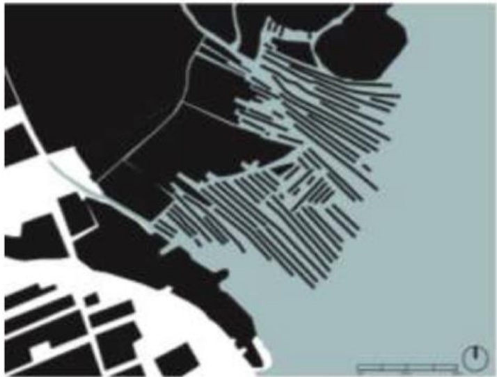
Figure 2. Evolution of Makoko slum in Lagos, Nigeria (Above: 2000 Below: 2014)