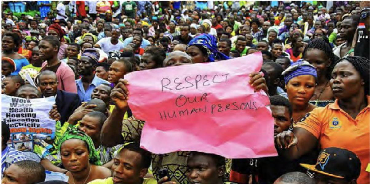
Figure 4: Members of the Iwaya/Makoko waterfront community at the Lagos State Secretariat in Alausa, Ikeja

resistance has also been supported by NGOs such as Social and Economic Action Rights Centre (SERAC), the Justice and Empowerment Initiative (JEI), who support informal settlements in Lagos in developing anti-eviction strategies, and often broker the relationship between civil society and the state (Osuoka & Aremu, 2020).