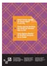
GLOBAL CHARTER- AGENDA FOR HUMAN RIGHTS IN THE CITY