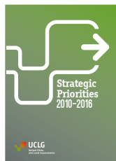
STRATEGIC PRIORITIES 2010-2016