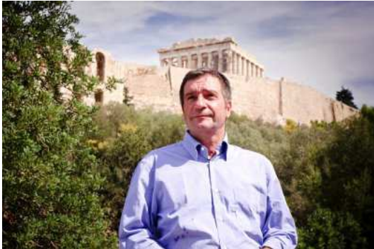
Yiorgos KAMINIS