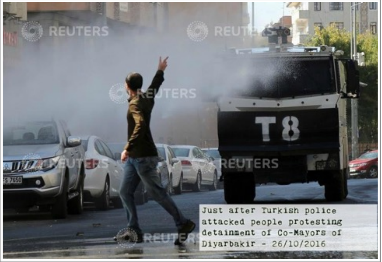
Just after Turkish police attacked people protesting detention of Co-Mayors of Diyarbakir - 26/10/2016