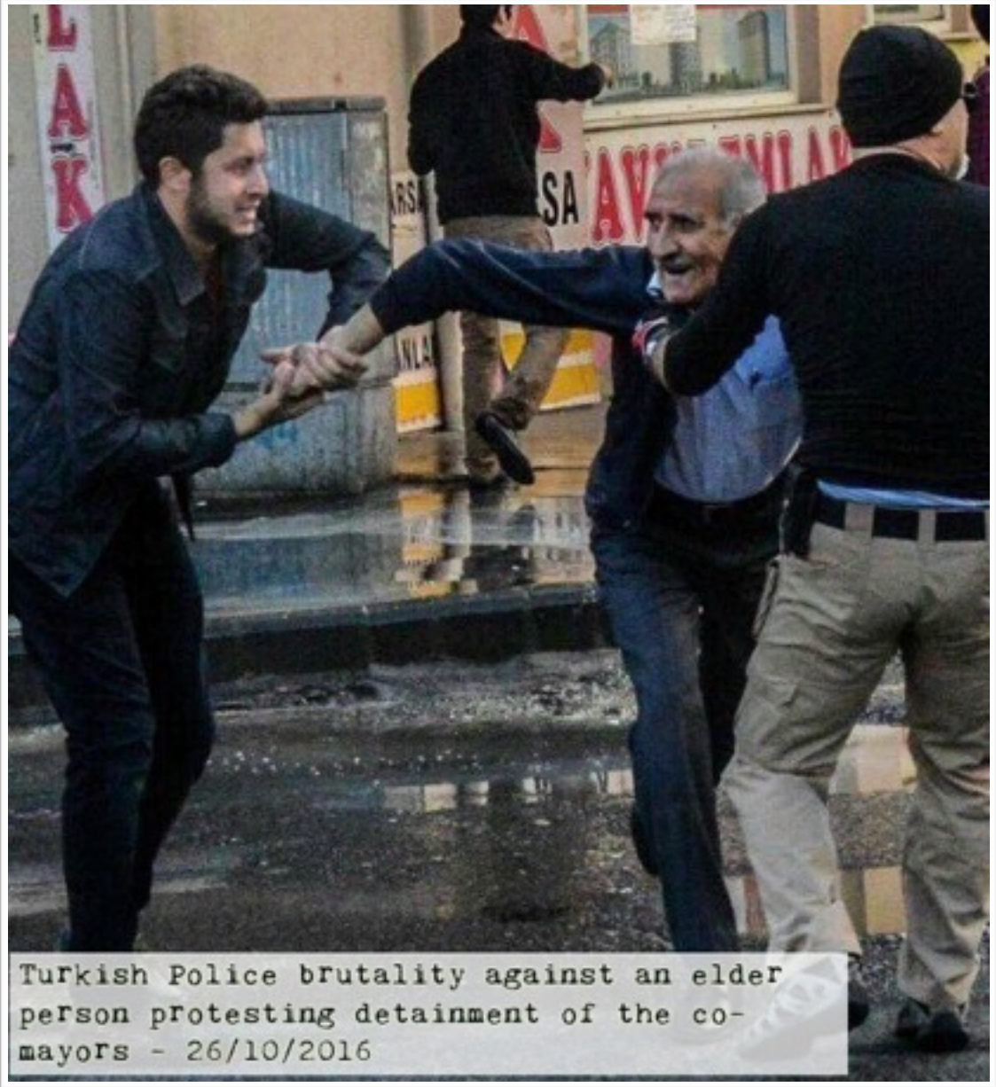
Turkish Police brutality against an elder person protesting detainment of the co-mayors - 26/10/2016